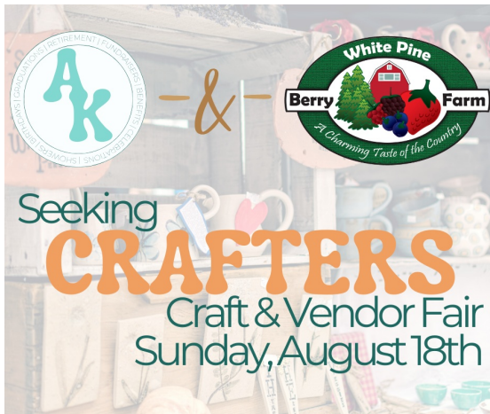
Click on the image above to be linked to the application (Due May 15th).